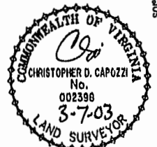
EXHIBIT "A" PHASE 15 FAIRWAYS VILLAS AT GREENSPRINGS, A CONDOMINIUM FOR GREENSPRINGS DEVELOPMENT, L.C. BERKELEY DISTRICT JAMES CITY COUNTY, VIRGINIA

COMMON AREA BMP LAKE # 1 AREA = 38,082 SQ. FT. = 0.8735 AC. SEE SHEET 3 FOR DETAIL