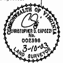
EXHIBIT "A" CLAIBORNE (A CONDOMINIUM COMMUNITY) PHASE THIRTEEN