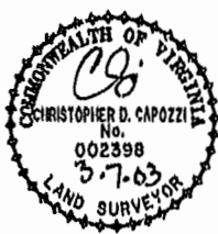
EXHIBIT "A" CLAIBORNE (A CONDOMINIUM COMMUNITY) PHASE TWELVE