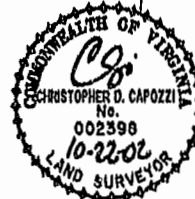
EXHIBIT "A" CLAIBORNE (A CONDOMINIUM COMMUNITY) PHASE SEVEN