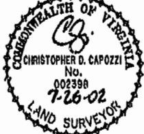
EXHIBIT "A" PHASE 26 FAIRWAYS VILLAS AT GREENSPRINGS, A CONDOMINIUM FOR GREENSPRINGS DEVELOPMENT, L.C. BERKELEY DISTRICT JAMES CITY COUNTY, VIRGINIA

COMMON AREA BMP LAKE # 1 AREA: 38,052 SQ. FT. = .8735 AC. SEE SHEET 3 FOR DETAIL