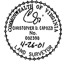
EXHIBIT "A" PHASE 24 FAIRWAYS VILLAS AT GREENSPRINGS, A CONDOMINIUM FOR GREENSPRINGS DEVELOPMENT, L.C. BERKELEY DISTRICT JAMES CITY COUNTY, VIRGINIA

SEE SHEETS 4 FOR LOCATION AND DETAILS OF PHASE 22, BLDG. #43