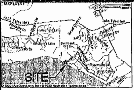
VICINITY MAP (NTS)