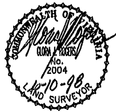
EXHIBIT # 1 PHASE THIRTEEN LAFONTAINE CONDOMINIUMS AT WILLIAMSBURG CROSSING PHASE THIRTEEN FOR UNIVERSITY SQUARE ASSOCIATES JAMESTOWN DISTRICT JAMES CITY COUNTY, VIRGINIA