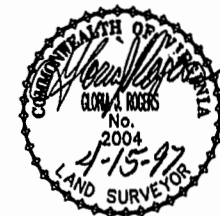
EXHIBIT # 1 PHASE TWO LAFONTAINE CONDOMINIUMS AT WILLIAMSBURG CROSSING PHASE TWO FOR UNIVERSITY SQUARE ASSOCIATES

Williamsburg/James City County Recorded 11:25 AM 29 day of March 2000 DOCUMENT # 000006323 Betsy B. Woolridge, Clerk of Circuit Court