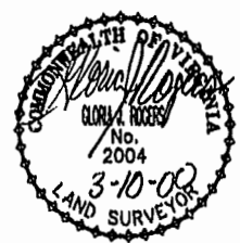
EXHIBIT "A" PHASE 29 FAIRWAYS VILLAS AT GREENSPRINGS, A CONDOMINIUM FOR GREENSPRINGS DEVELOPMENT, L.C. BERKELEY DISTRICT JAMES CITY COUNTY, VIRGINIA

COMMON AREA BMP LAKE # 1 AREA = 38,052 SQ. FT. = 0.8735 AC. SEE SHEET 5 FOR DETAIL