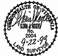
EXHIBIT "A" PHASE 38 FAIRWAYS VILLAS AT GREENSPRINGS, A CONDOMINIUM FOR GREENSPRINGS DEVELOPMENT, L.C.