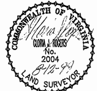
EXHIBIT "A" PHASE 10 FAIRWAYS VILLAS AT GREEN SPRINGS, A CONDOMINIUM FOR GREEN SPRINGS DEVELOPMENT, L.C. BERKELEY DISTRICT JAMES CITY COUNTY, VIRGINIA

PLAT RECORDED IN P.B. NO. 24 PAGE 22 of 26