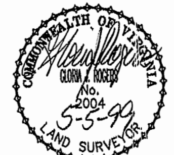
EXHIBIT "A" PHASE 43 FAIRWAYS VILLAS AT GREEN SPRINGS, A CONDOMINIUM FOR GREEN SPRINGS DEVELOPMENT, L.C.