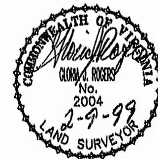
EXHIBIT "A" PHASE 31 FAIRWAYS VILLAS AT GREEN SPRINGS, A CONDOMINIUM FOR GREEN SPRINGS DEVELOPMENT, L.C. BERKELEY DISTRICT JAMES CITY COUNTY, VIRGINIA