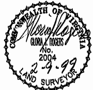
EXHIBIT "A" PHASE 31 FAIRWAYS VILLAS AT GREEN SPRINGS, A CONDOMINIUM FOR GREEN SPRINGS DEVELOPMENT, L.C. BERKELEY DISTRICT JAMES CITY COUNTY, VIRGINIA

COMMON AREA BMP LAKE # 1 AREA = 38,052 SQ. FT. = 0.8735 AC. SEE SHEET 3 FOR DETAIL