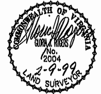
EXHIBIT "A" PHASE 31 FAIRWAYS VILLAS AT GREEN SPRINGS, A CONDOMINIUM FOR GREEN SPRINGS DEVELOPMENT, L.C. BERKELEY DISTRICT JAMES CITY COUNTY, VIRGINIA