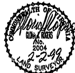
EXHIBIT "C" PHASE 6 FAIRWAYS VILLAS AT GREEN SPRINGS, A CONDOMINIUM FOR GREEN SPRINGS DEVELOPMENT, L.C. BERKELEY DISTRICT JAMES CITY COUNTY, VIRGINIA

Recorded 8 day of Feb , 1999 DOCUMENT # 99-0002614 2:30pm [Signature] Clerk PLAT RECORDED IN P.B. NO. 71 PAGE 102-104 No. 2004 2-2-99 LAND SURVEYOR