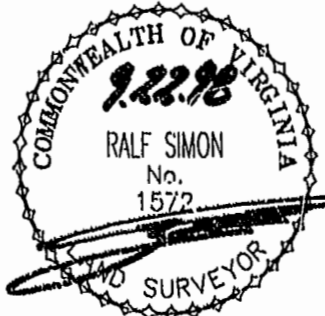
EXHIBIT # 1 PHASE SIXTEEN LAFONTAINE CONDOMINIUMS AT WILLIAMSBURG CROSSING PHASE SIXTEEN FOR UNIVERSITY SQUARE ASSOCIATES JAMESTOWN DISTRICT JAMES CITY COUNTY, VIRGINIA