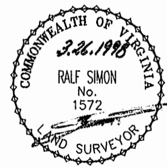
EXHIBIT "C" PHASE 1 FAIRWAYS VILLAS AT GREEN SPRINGS, A CONDOMINIUM FOR GREEN SPRINGS DEVELOPMENT, L.C.