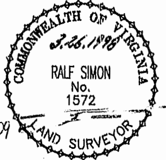
EXHIBIT "C" PHASE 1 FAIRWAYS VILLAS AT GREEN SPRINGS, A CONDOMINIUM FOR GREEN SPRINGS DEVELOPMENT, L.C. BERKELEY DISTRICT JAMES CITY COUNTY, VIRGINIA