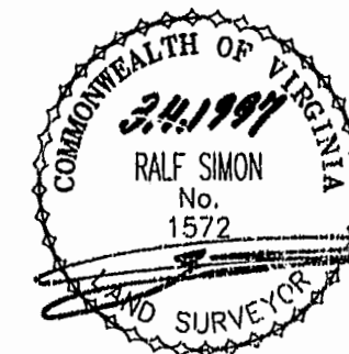
EXHIBIT # 1 PHASE FIVE LAFONTAINE CONDOMINIUMS AT WILLIAMSBURG CROSSING PHASE FIVE

FOR WILLIAMSBURG SQUARE ASSOCIATES JAMESTOWN DISTRICT JAMES CITY COUNTY, VIRGINIA