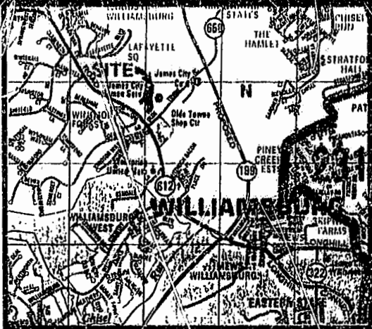
LOCATION MAP SCALE: 1"=2000'

CE - COMMON ELEMENTS COMMON ELEMENTS INCLUDE ALL PORTIONS OF THE CONDOMINIUM OTHER THAN THE UNITS SHOWN AND DESIGNATED HEREON AND DEFINED IN THE CONDOMINIUM DOCUMENTS AND THE LIMITED COMMON ELEMENTS. EXAMPLES OF COMMON ELEMENTS ARE: PARKING, PAVED AREAS, THE GROUNDS (WHETHER OR NOT LANDSCAPED), ALL PORTIONS OF THE BUILDINGS NOT A PART OF THE UNIT NOR DEFINED AS LIMITED COMMON ELEMENTS, AND ALL CONDUITS, INSTALLATION, WIRES, PIPES, EQUIPMENT, ETC. WHICH SERVE OTHER COMMON ELEMENTS OR WHICH SERVE MORE THAN ONE UNIT. LCE - LIMITED COMMON ELEMENTS EXCEPT AS MAY BE OTHERWISE EXPRESSLY PROVIDED, LIMITED COMMON ELEMENTS INCLUDE DOORS, WINDOWS, PORCHES, BALCONIES, AND ANY OTHER APPARATUS DESIGNED TO SERVE A SINGLE UNIT, BUT LOCATED OUTSIDE THE BOUNDARIES THEREOF.