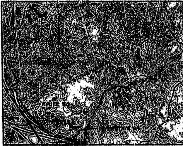
VICINITY MAP SCALE: 1" = 2000'