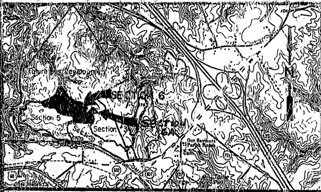
VICINITY MAP: Scale 1" = 2,000