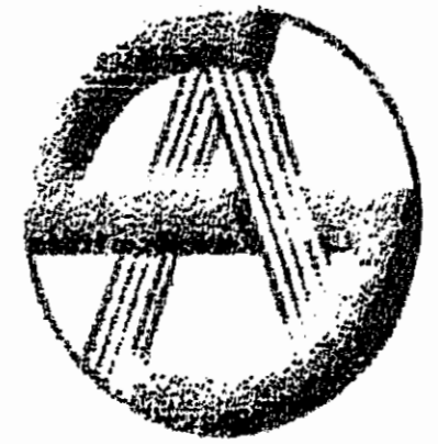
EXHIBIT B "QUARTERLAND COMMONS" - II PHASES IV & V

SPEARMAN & ASSOCIATES, P. C. SURVEYING AND PLANNING 489 McLaws Circle — WILLIAMSBURG, VIRGINIA (804) 253-8720