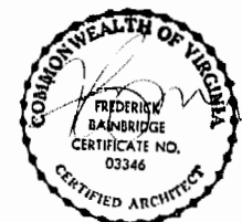
EXHIBIT B CONFERENCE CENTER CONDOMINIUM PHASE 2A BEING A SUBDIVISION OF PROPERTY OF BUSCH PROPERTIES, INC. KINGSMILL ON THE JAMES JAMES CITY COUNTY, VIRGINIA SCALE: 1" = 8' DATE: 5/07/90 Langley and McDonald, P.C. VIRGINIA BEACH AND WILLIAMSBURG, VIRGINIA Bainbridge and Associates ARCHITECTS SHEET 14 OF 16