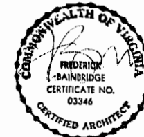
EXHIBIT B CONFERENCE CENTER CONDOMINIUM PHASE 2A BEING A SUBDIVISION OF PROPERTY OF BUSCH PROPERTIES, INC. KINGSMILL ON THE JAMES JAMES CITY COUNTY, VIRGINIA SCALE: 1" = 8' DATE: 5/07/90 Langley and McDonald, P.C. VIRGINIA BEACH AND WILLIAMSBURG, VIRGINIA Bainbridge and Associates ARCHITECTS SHEET 13 OF 16