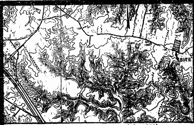
VICINITY MAP 1" : 2000'

TOTAL AREA 270,725.115 SQ.FT. / 6.215 AC. LOT AREA 260,328.068 SQ.FT. / 5.976 AC. RIGHT-OF-WAY OVERLAP 4,137.352 SQ.FT. / 0.095 AC. OVERLAP 6,259.695 SQ.FT. / 0.144 AC.