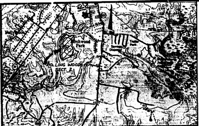
VICINITY MAP SCALE: 1" = 2000'