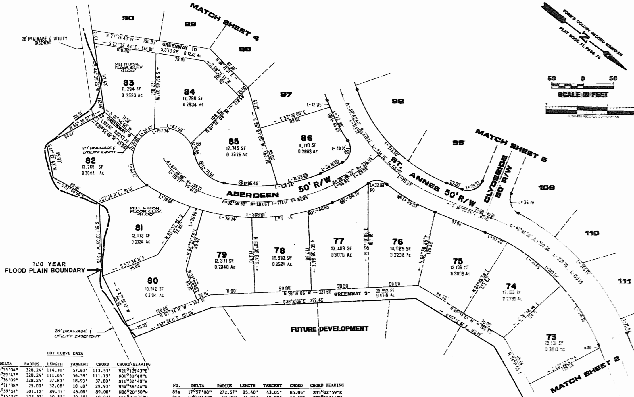
LOT CURVE DATA