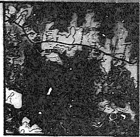
VICINITY MAP SCALE: 1" = 2,000'

NOTE: PROPERTY LINE IS CENTER LINE OF RAVINE, FROM A → B.