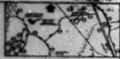
LOCATION MAP 1" = 100 FEET