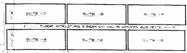
3 THRU SECTION SCALE: 1/8" = 1'-0"