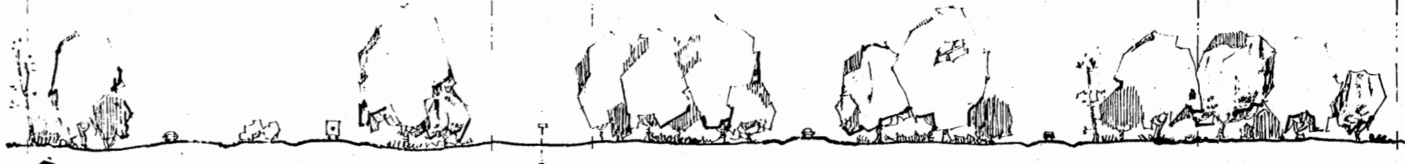
SECTION (PIPELINE IN PARALLEL EASEMENT) 40 SCALE

RT. 159 - R.O.W. 230' PIPELINE 50' 300' R.O.W. - CARTERS GROVE PARKWAY DRIVE SCENIC EASEMENT 100'