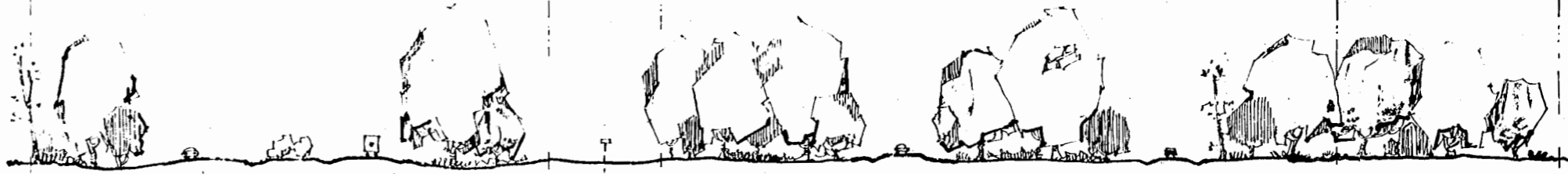
SECTION (PIPELINE IN PARALLEL EASEMENT) 40 SCALE

RT. 159 - R.O.W. 230' PIPELINE 50' 300' R.O.W. - CARTERS GROVE PARKWAY DRIVE SCENIC EASEMENT 100'