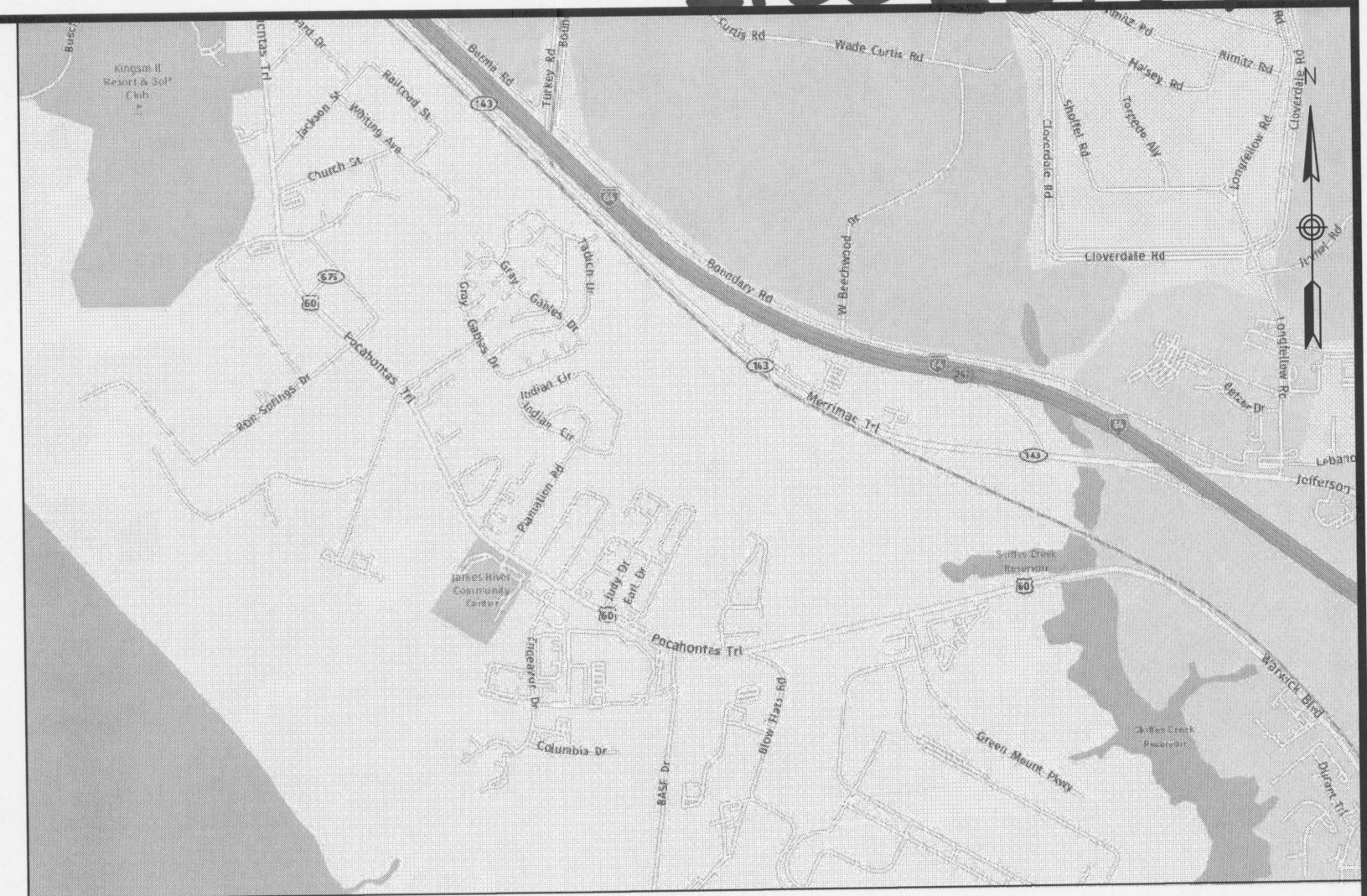
VICINITY MAP 1"=2,000'