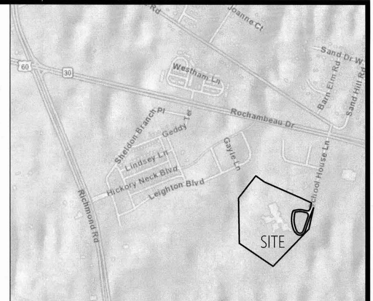
VICINITY MAP 1" = 1,000'

2 Large/Small Plat(s) Recorded herewith as # 202517467