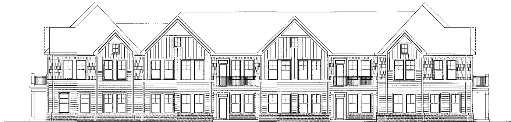
EXHIBIT D VILLAGE GREEN NORTH AT QUARTERPATH BUILDING 71, A CONDOMINIUM WILLIAMSBURG, VA

CERTIFICATION OF PLANS I, Brian Long , Surveyor A DULY LICENSED ENGINEER/ARCHITECT, IN THE COMMONWEALTH OF VIRGINIA, DO HEREBY CERTIFY THAT THIS PLAN IS ACCURATE AND COMPLIES WITH SECTION 55.1-1920(B) OF THE VIRGINIA CONDOMINIUM ACT AS AMENDED, AND THAT ALL UNITS OR PORTIONS OF SUCH UNITS SHOWN HEREON ARE SUBSTANTIALLY COMPLETED. DATE: 4-6-23 NAME: Brian Long LIC. NO. 2572 SQUARE FOOTAGES ARE CALCULATED BY THE SUM OF HORIZONTAL INTERIOR AREAS MEASURED FROM THE BACKSIDE OF SHEETROCK.