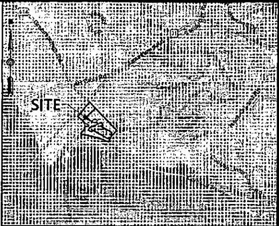
Vicinity Map 1"=2,000'