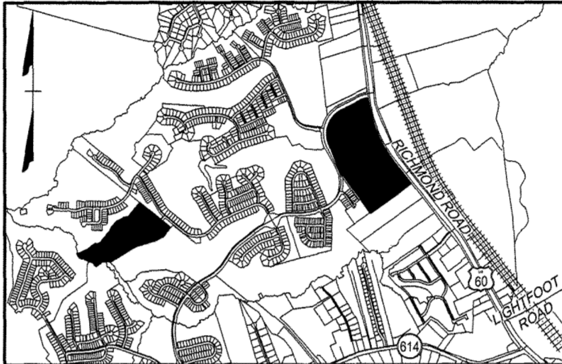
VICINITY MAP SCALE: 1" = 2000'