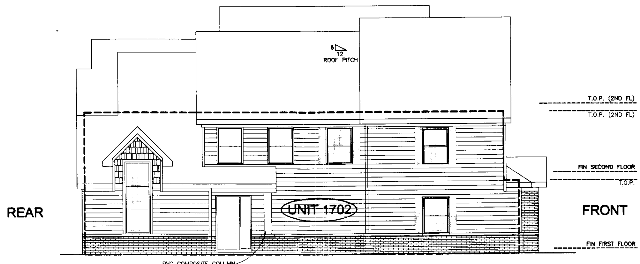
LEFT SIDE ELEVATION 1/8" = 1'-0"