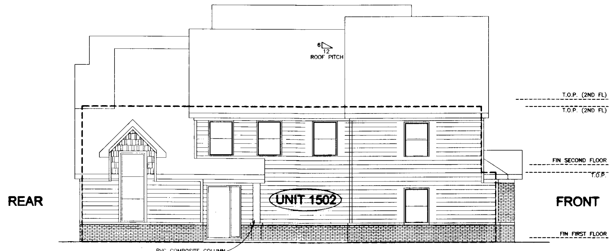
LEFT SIDE ELEVATION 1/8" = 1'-0"