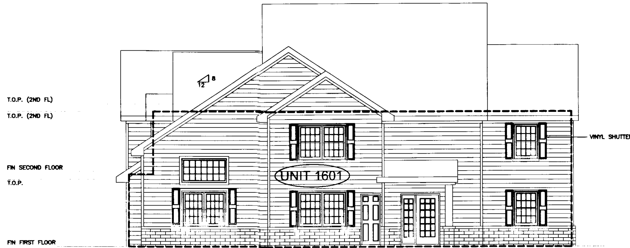
LEFT SIDE ELEVATION 1/8" = 1'-0"