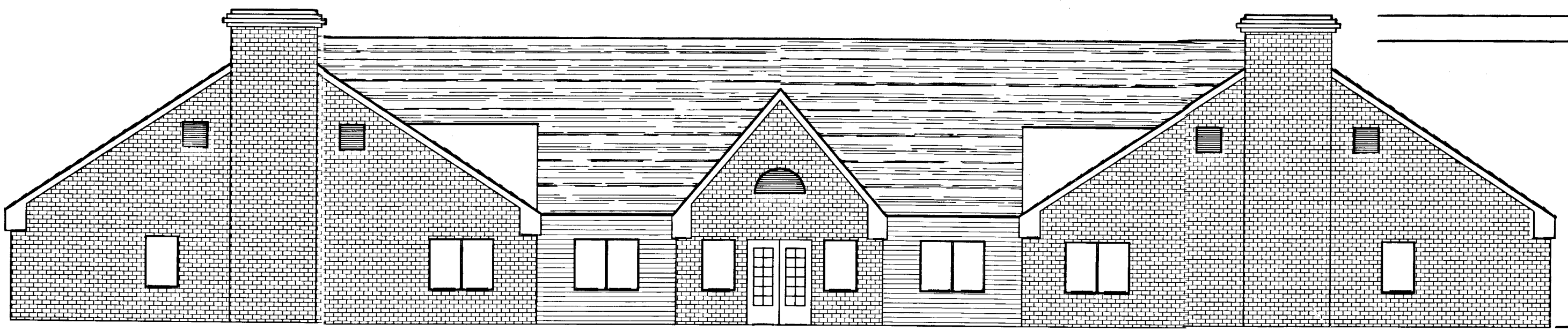
UNIT #2 VIEW A-A SCALE: NOT TO SCALE

1.25' TOP OF CHIMNEY ELEVATION = 56.0' ROOF PEAK ELEVATION = 54.75' 22.45' NO FINISH FLOOR ELEVATION GROUND ELEVATION = 32.3'