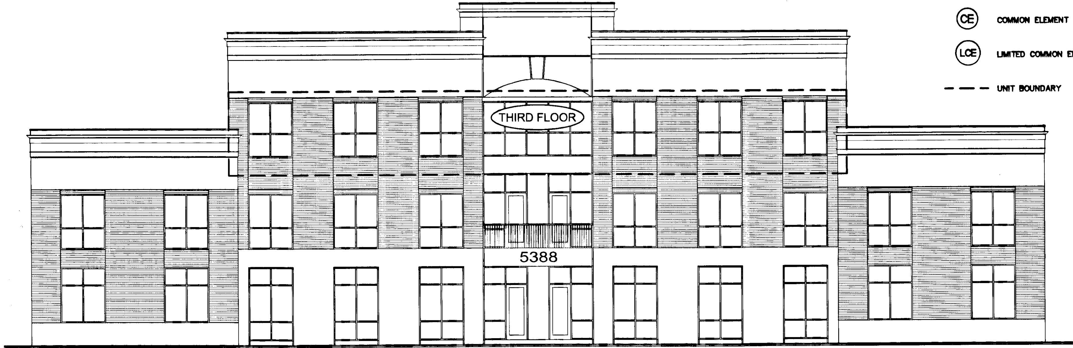
FRONT ELEVATION (DISCOVERY PARK BLVD.)