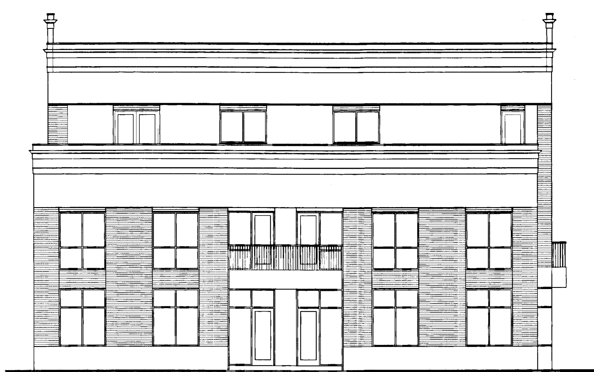
RIGHT SIDE ELEVATION NOT TO SCALE