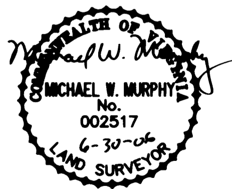
EXHIBIT "A" PHASE 46 FAIRWAYS VILLAS AT GREENSPRINGS, A CONDOMINIUM FOR GREENSPRINGS DEVELOPMENT, L.C. BERKELEY DISTRICT JAMES CITY COUNTY, VIRGINIA

Large/Small Plat(s) Recorded herewith as # 060017217