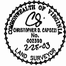
EXHIBIT "A" PHASE 16 FAIRWAYS VILLAS AT GREENSPRINGS, A CONDOMINIUM FOR GREENSPRINGS DEVELOPMENT, L.C. BERKELEY DISTRICT JAMES CITY COUNTY, VIRGINIA