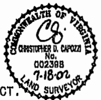
EXHIBIT "A" CLAIBORNE (A CONDOMINIUM COMMUNITY) PHASE TWO CITY OF WILLIAMSBURG, VIRGINIA

City of Williamsburg & County of James City Circuit Court: This PLAT was recorded on 22 July 2002 at 10:29 AM PM-PB Pla. PG 22-701 DOCUMENT # 021288 BETSY B. WOOLRIDGE, CLERK Betsy Woolridge Dep. Clerk