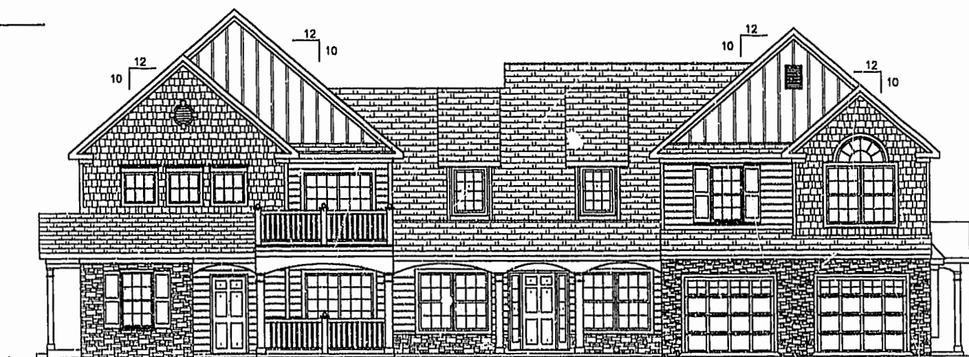
FRONT ELEVATION NOT TO SCALE

City of Williamsburg & County of James City Circuit Court: This PLAT was recorded on 22 July 2002 at 10:29 AM PM-PB Pla. PG 22-701 DOCUMENT # 021288 BETSY B. WOOLRIDGE, CLERK Betsy Woolridge Dep. Clerk