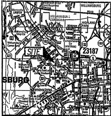
VICINITY MAP SCALE: 1"=2000'

SURVEY OF A PORTION OF LOT 2 AS SHOWN ON PLAT ENTITLED "PROPERTY OF RH. BRAXTON" WILLIAMSBURG, VIRGINIA FOR WILLIAMSBURG REDEVELOPMENT & HOUSING AUTHORITY