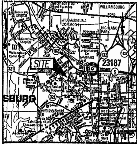
VICINITY MAP SCALE: 1"=2000'

SURVEY OF A PORTION OF LOT 2 AS SHOWN ON PLAT ENTITLED "PROPERTY OF RH. BRAXTON" WILLIAMSBURG, VIRGINIA FOR WILLIAMSBURG REDEVELOPMENT & HOUSING AUTHORITY